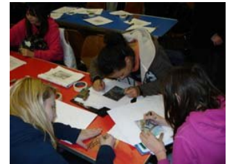
Students design transfers for their mugs

A visit to Blists Hill, an authentic Victorian Town set on the site of an original foundry always proves popular and this year students had the opportunity to interact with an even wider range of traditional crafts people, shop keepers and workers.