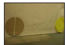
SHELL ECO-MARATHON UPDATE