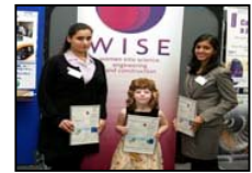
WISE AWARD FOR NEWSTEAD STUDENT