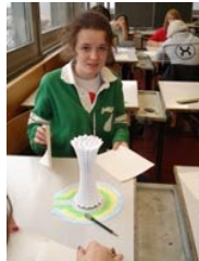
A German engineering lesson

The students also spent a day at a school in Starnberg, where they took part in a German engineering lesson, had a traditional German lunch and met their pen-pals. The trip was a huge success, with everyone having a fantastic time.