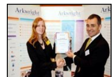
ARKWRIGHT SCHOLARS SUCCESS