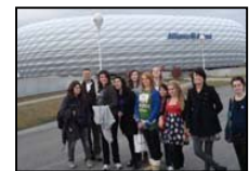
MUNICH WELCOMES NEWSTEAD STUDENTS