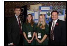
STUDENTS PRESENT AT PARLIAMENT