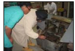
THE ENGINEERING DIPLOMA IN ACTION