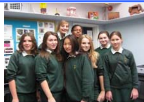
The Shell Eco-Marathon Team need you!

To commence this project, the team first need to acquire the numerous components needed to assemble such a vehicle, e.g. engine, gearbox, etc.