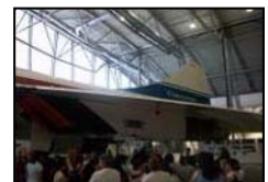
NEW SUMMER SCHOOL TAKES OFF