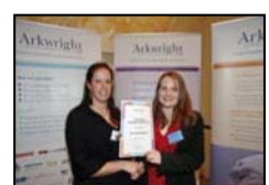
MORE AWARD SUCCESSSES