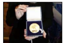
SIR HENRY ROYCE MEDAL SUCCESS