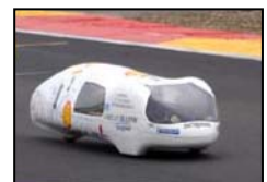
SHELL ECO-MARATHON BID LAUNCHED